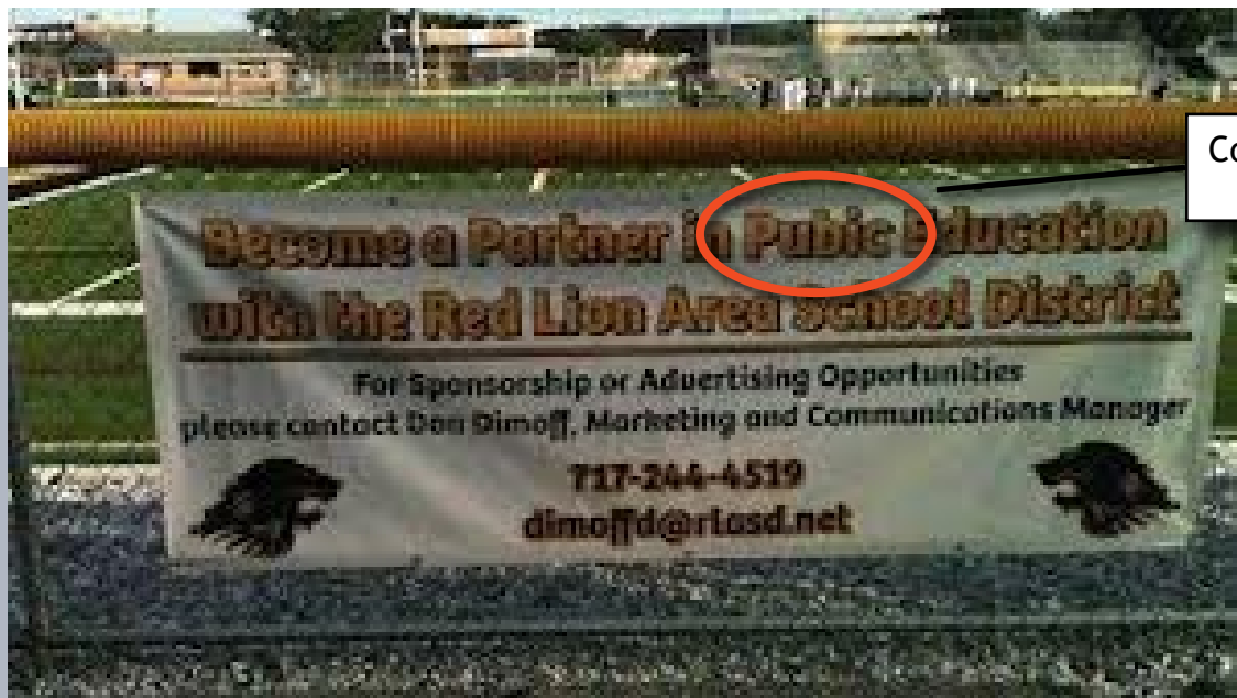
As seen on Yahoo! Taken at Red Lion Area School District, Pennsylvania.